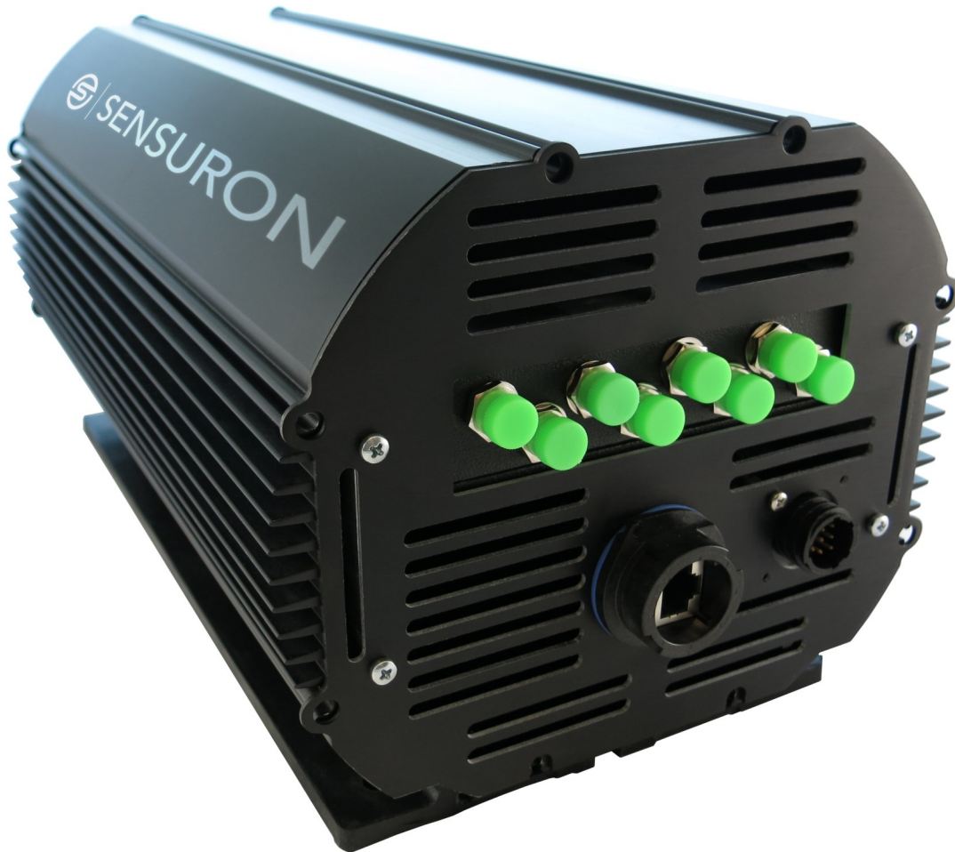
RTS125 fully ruggedized FOS system